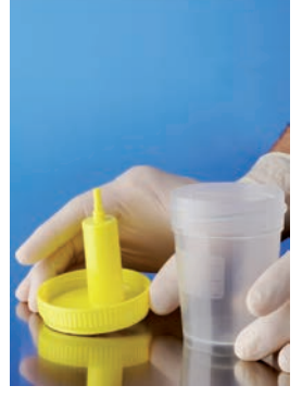
2. LAY THE CAP UPSIDE DOWN ON A CLEAN SURFACE.