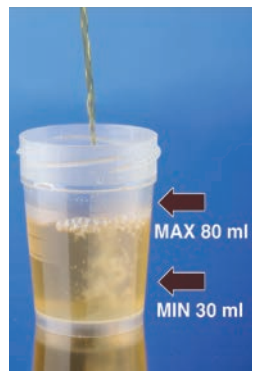
4. COLLECT THE URINE SAMPLE. Fill the container up to 34 of the capacity.