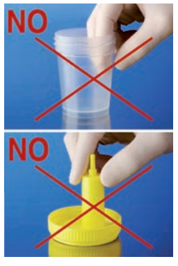
3. DO NOT TOUCH INTERNAL SURFACES OF THE CONTAINER AND CAP.