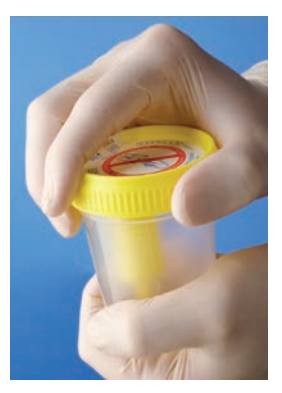
1. Attention: for microbiological tests clean the hands and genitals thoroughly before use. OPEN THE CAP BY UNSCREWING ANTI-CLOCKWISE.