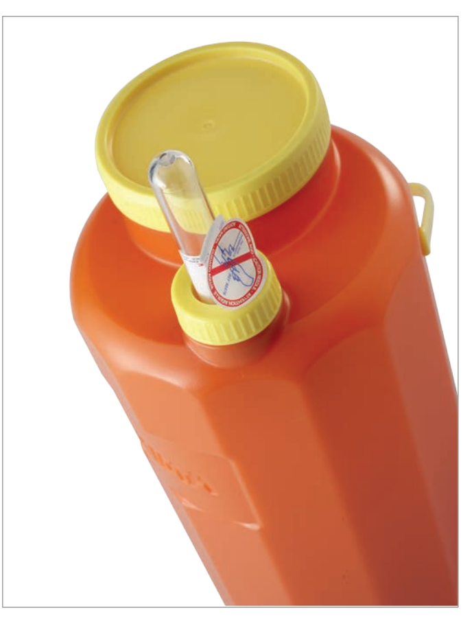
The cylindrical container features a urine collection device for a safe sample transfer into vacuum tubes and is provided with an handle for a comfortable transport.