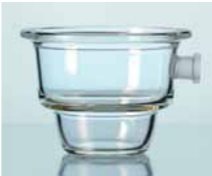
With NS 24/29, NOVUS

Ideal for drying and drying processes, storage under vacuum and protection from the effects of air and moisture. Applications include cultivation of organisms, material research and corrosion testing, cleaning equipment for analysis of trace elements, gas and liquid reactions and they can be used as a mini cleanroom for chip technology.