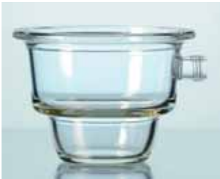
With GL 32 MOBILEX