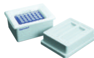
IsoSafe with IsoRack and -21 °C IsoPack