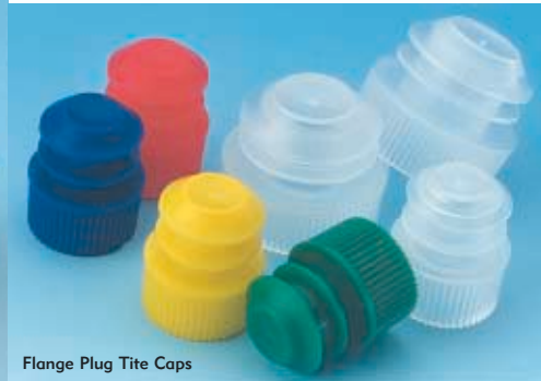
Flange Plug Tite Caps